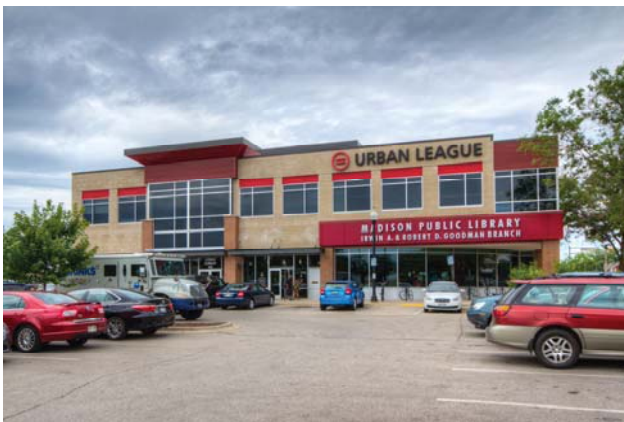
Urban League and Public Library on the property's outlet