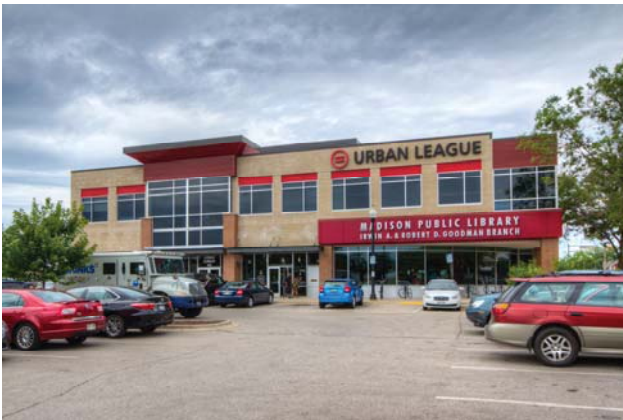
Urban League and Public Library on the property's outlet